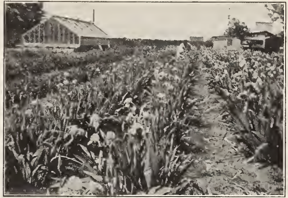
One of my Iris Gardens

We grow Irises extensively. The ones listed for 10c each we can supply at $5.00 per 100.